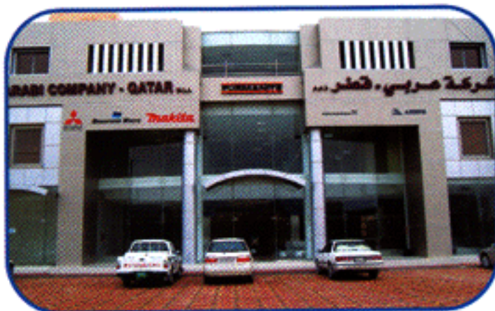
Salwa Street, Near Tayseer Petrol Station, Doha

Arabi Company Qatar is a newly established company in December 2003 to be one of the major companies in Qatar in the field of Supply, Installation, Commissioning of all types of Water Equipment, Access Equipment, Pumps, Sand Filters, Water Tanks, Piping Systems, Water Heaters, Cooling Systems, Fogging Systems, Irrigation Materials, Leak Sealing Services & Power Tools supply. Our products/systems are in view in large easily accessible showroom in Doha.