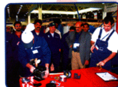
Plumbers Demo Day

Title : Plumbers Demo Day Date : December 2003 Venue : Kuwait – Messilah Beach Hotel Subject : Get together with Users & Plumbers