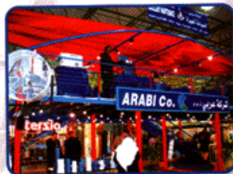
Building & Water Exhibition

Title : Building & Water Exhibition Date : December 20 – 26, 2003 Venue : Kuwait – Mishref Trade Fair Subject : Building Materials & Water Equipment