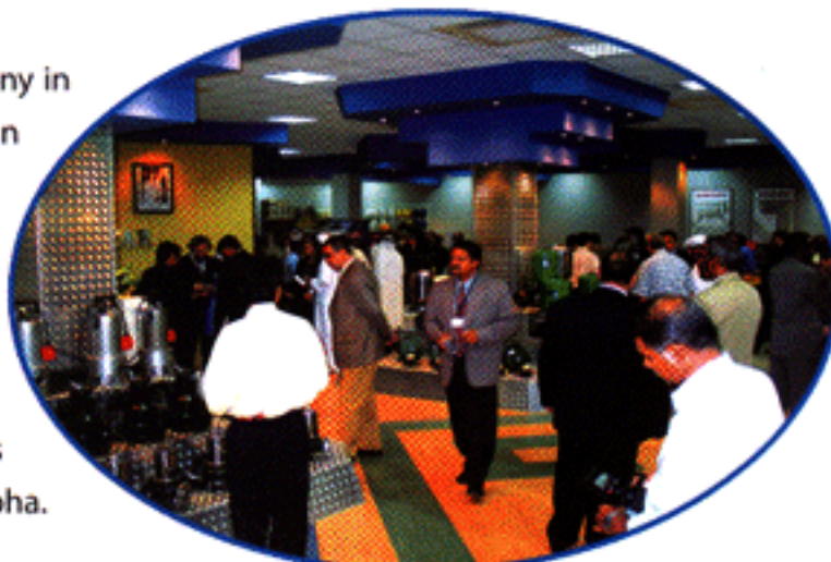
Interior of Arabi Company Qatar Showroom

Arabi Company Qatar is a newly established company in December 2003 to be one of the major companies in Qatar in the field of Supply, Installation, Commissioning of all types of Water Equipment, Access Equipment, Pumps, Sand Filters, Water Tanks, Piping Systems, Water Heaters, Cooling Systems, Fogging Systems, Irrigation Materials, Leak Sealing Services & Power Tools supply. Our products/systems are in view in large easily accessible showroom in Doha.