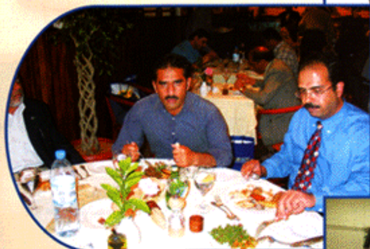
Staff at dinner