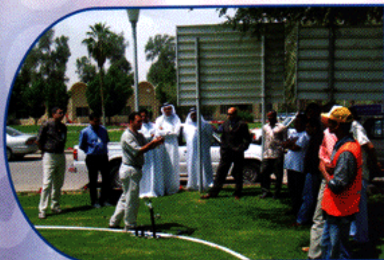
Public Authority for Agriculture Demo Day

To prove the quality of our products and to make our customers confident, demonstration days are scheduled to illustrate the advantage and installation procedure.