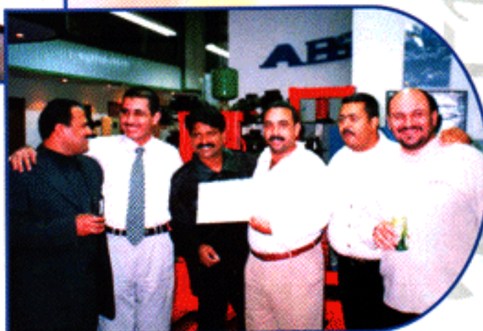
Shoulder-to-Shoulder (Sales & Tech staff)